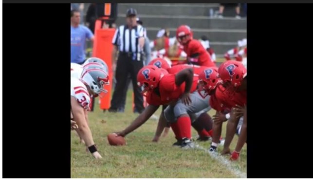
Peekskill Athletics 2019-2020